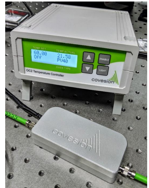
Covesion packaged waveguide use with temperature controller OC2

Contact us with your specification to discuss availability and pricing